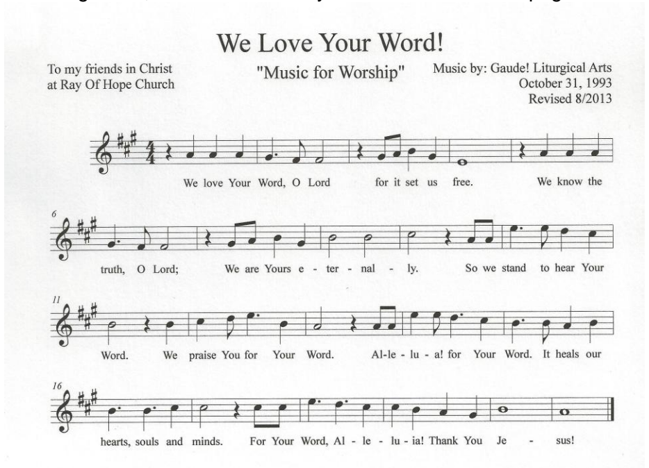
August 29, 2021 22nd Sunday of the Church Year B page: 8

©1993 by Gaude! Liturgical Arts. All Rights Reserved. International Copyright Secured. Reprinted here under CCLI#706121